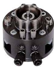
F = fixed part (robot side)