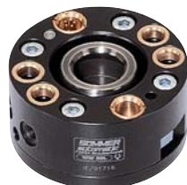
L = loose part (tool side)